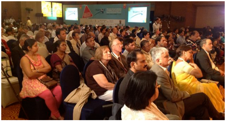
General view of plenary session at TRANSED

After recent conferences in Hong Kong (2010) and India (2012), the next TRANSED will be hosted in 2015 by the Instituto Superior Técnico in Lisbon, Portugal – go to www.ist.eu as the conference takes shape in months to come.