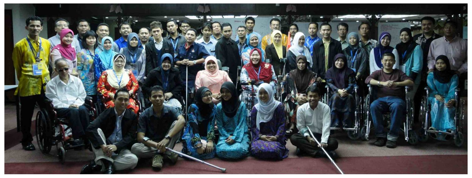
Persons with disabilities and other stakeholders work together in coordination with Kuala Lumpur's city government as they are trained to perform access audits for local facilities.