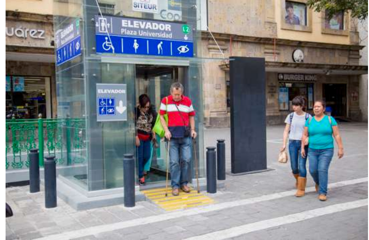
This photo is planned to appear on the front cover.

The Institute for Transportation Development and Policy (ITDP) will soon publish Access and Persons with Disabilities in Urban Areas, part of their series on Policies for Inclusive Transport-oriented Development. The publication is set for release in early 2022 and is an example of the ITDP's increasing focus on equity, access, and inclusion for all.