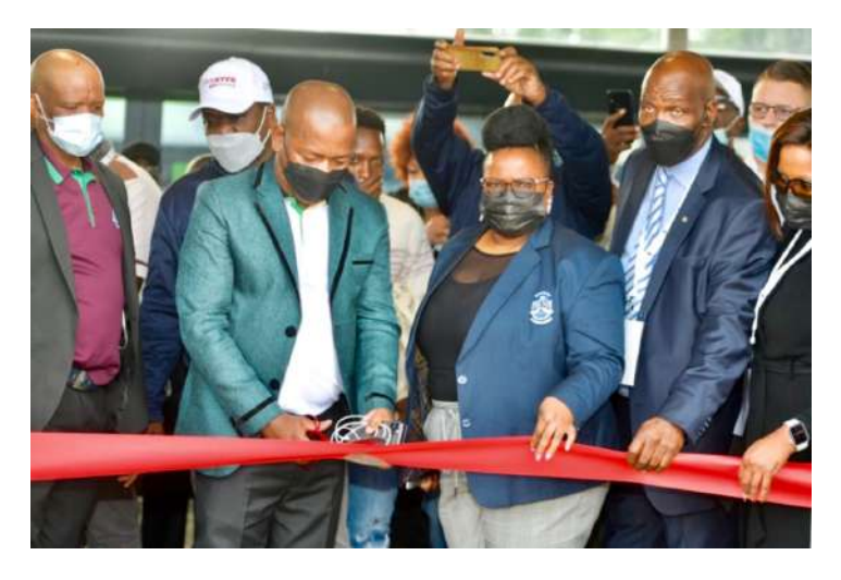
The CoE is the first city in South Africa to develop a clear Universal Access Commitment Statement

Nine stations on the new BRT line run through Thembisa, one of the biggest towns in the CoE with a population of over half a million persons. The photo below shows the Mayor of the City of Ekurhuleni cutting the ribbon to officially open the stations on the new trunk route of the Harambee Bus System.