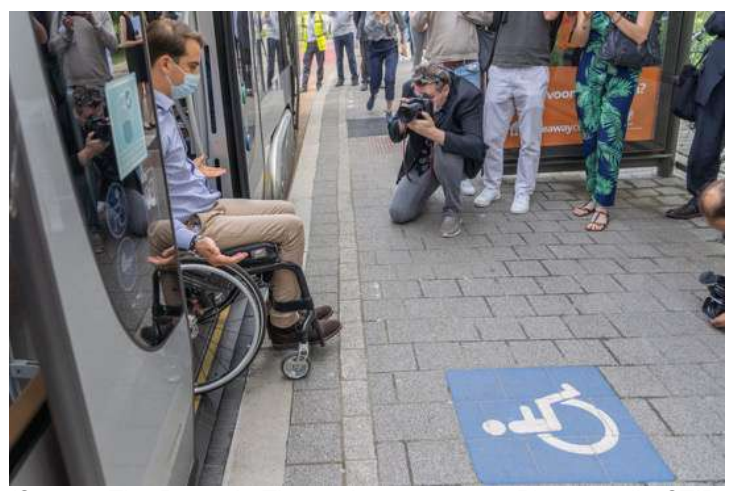
More News & Notes on page 8

Belgium: The tram network of <u>Brussels</u> is being upgraded to increase accessibility for passengers with disabilities. Plans call for combining a raised platform with the insertion of rubber platform edges to fill the horizontal space between the platform and the tram.